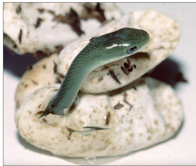
Fig. 1 An amniote, the Rough Greensnake ( Opheodrys aestivus ), hatching from an egg.

Conflicting phylogenetic results from different morphological and molecular data sets have clouded the picture of amniote macroevolution and have slowed the process of establishing a clear consensus of views between paleontologists and molecular systematists. Synapsids (mammals) are accepted to be the closest relatives of diapsid reptiles. Turtles lack temporal holes in the skull, however, and have been viewed as the only surviving anapsid amniotes. Based on this and other characters, they