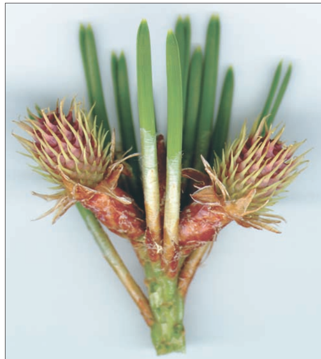
Fig. 1 Female strobili of a gymnosperm ( Pinus sylvestris )

Molecular phylogenetic evidence for the close relationship between gymnosperms and angiosperms is strong. A study of seven genes (from the chloroplast, mitochondrial, and nuclear genome), with a sampling of 18 gymnosperms, 19 angiosperms, and numerous other landplants (192 species total), yielded maximum likelihood (ML) bootstrap values of 87% and 100%, respectively, for the monophyly of gymnosperms and angiosperms ( 4 ). With